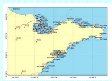
The map of environmental monitoring station of the coastal and marine area in Shandong Province in 2006

The monitoring result show that most of marine area is clean or relative clean. The polluted area is mainly located in Jiaozhou Bay, and the major pollutants are inorganic nitrogen and active phosphate.