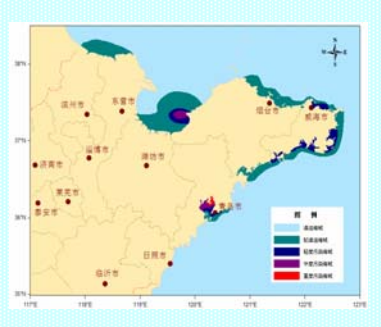
al and marine polluted areas in Sh Province in 2006